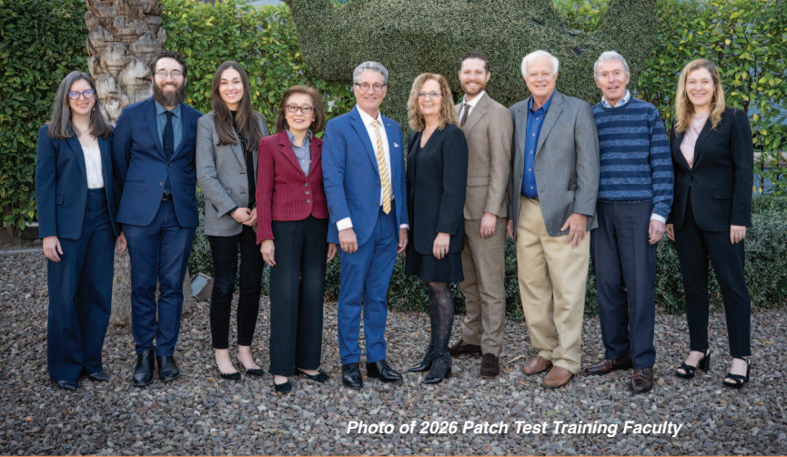
Photo of 2026 Patch Test Training Faculty